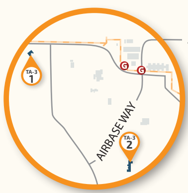
TECH AREA III