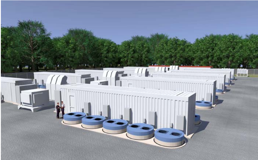
20 MW flywheel regulation plant planned for Stephentown, New York.