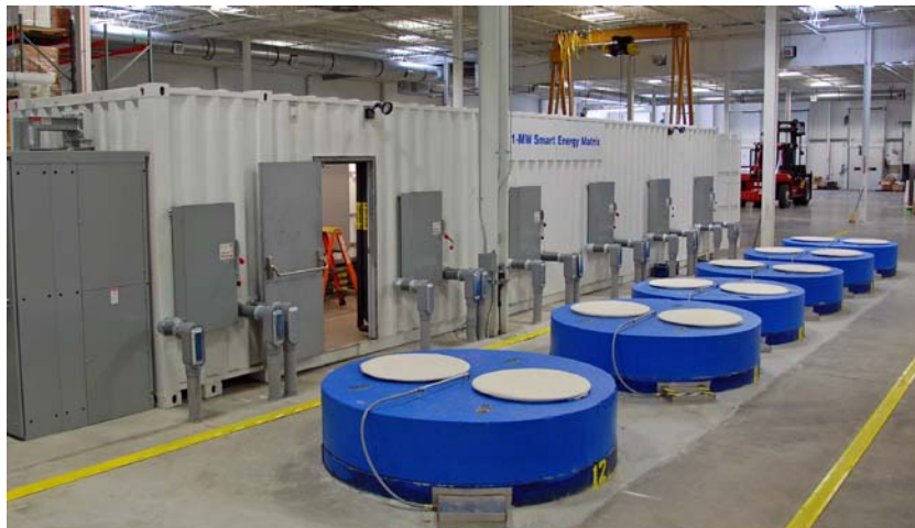
Figure 1: 1 MW Flywheel Regulation System Operating in New England

Flywheels are installed below grade while the power electronics, monitoring and control systems are housed in a steel cargo container