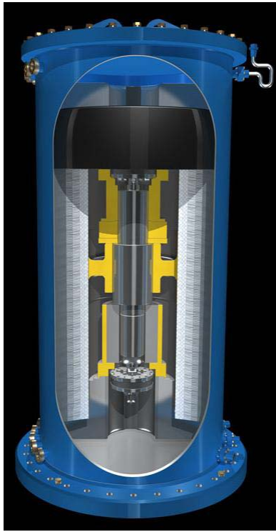
Figure 2: Smart Energy 25 Flywheel

Each flywheel can release and store energy at up to a 100 kW power level; ten flywheels make up a 1 MW Smart Energy Matrix.