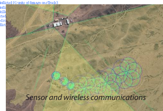
Post-processing analysis tools give insights into "key" players and events in a scenario