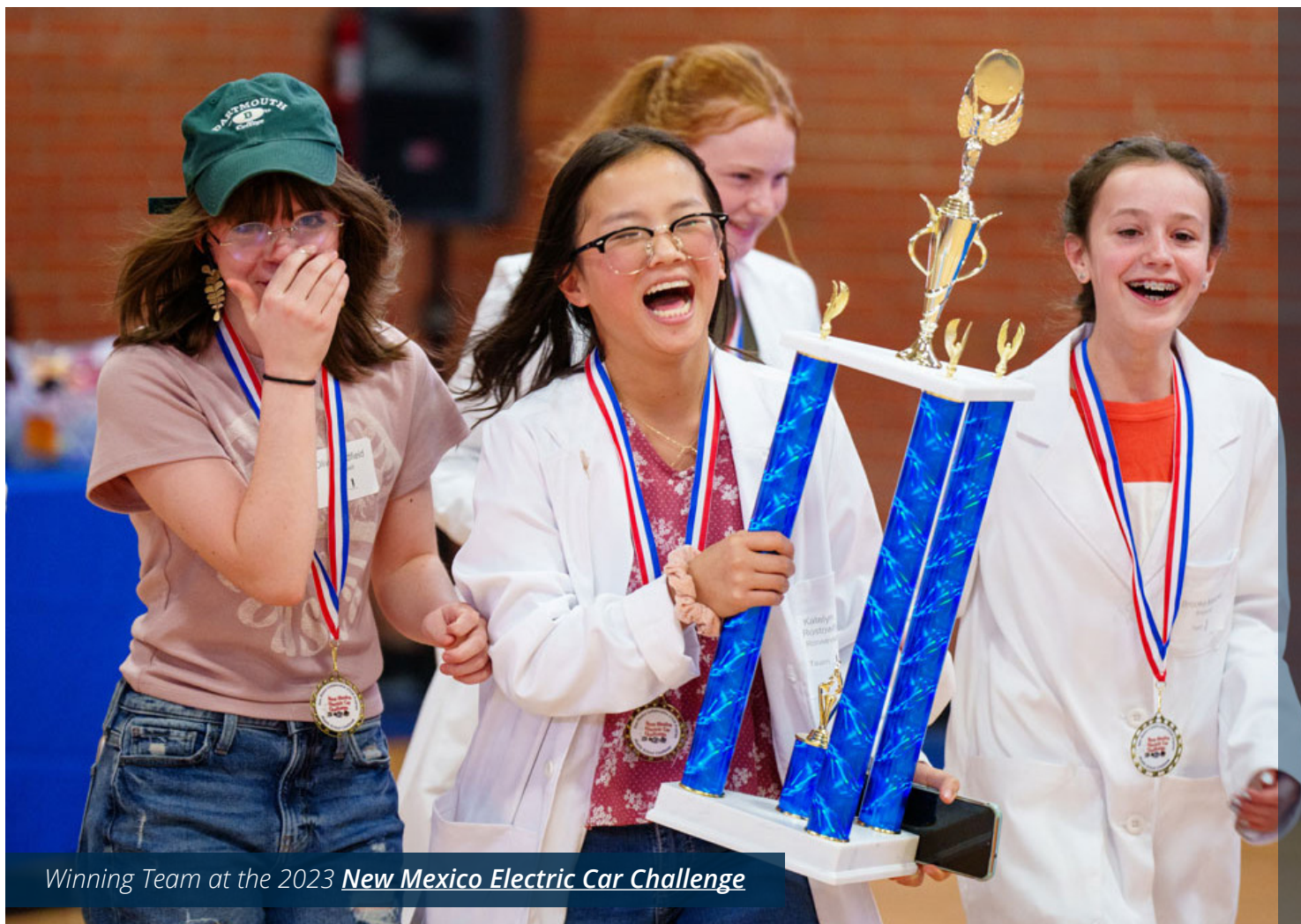
Winning Team at the 2023 New Mexico Electric Car Challenge

Sandia National Laboratories is committed to being an informed, compassionate and contributing neighbor in our local communities of Albuquerque, NM, Livermore, CA, and other remote sites. This commitment has been demonstrated throughout Sandia's history and is an enduring part of our future. In addition to Sandia's corporate giving, our generous employees contribute funds, donate supplies, and volunteer at non-profits, academic events and in schools.