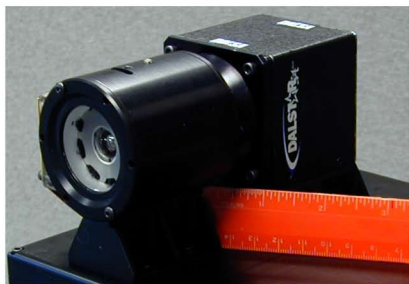
Liquid Crystal SLM

In summary, adaptive optics has allowed Sandia researchers to transcend conventional glass optical systems and improve capability in many applications of interest to the military. In the case of optical zoom, these technologies allow a user to increase the resolution over an area-of-interest in near real-time and may eventually eliminate the need for gimbaled or multiple camera systems commonly used for acquisition and tracking.