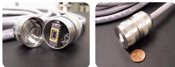
Figure 1. Four-polymer chemiresistor array and temperature control system in stainless steel geologic probe with GORE-TEX® membrane for monitoring chemical concentrations in groundwater and/or soil.