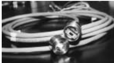
CLOSEUP of sensor housing and cable.

The temperature sensor will monitor the temperature, while the heater will keep the temperature levels high enough so that water will not condense on the sensors. The preconcentrator will concentrate chemicals at ambient temperature on an adsorbent material and then, by heating the preconcentrator, the chemicals will be freed so they can be analyzed by the chemiresistors. This makes it possible to analyze chemicals whose concentration levels may be too low for direct detection by the chemiresistors.