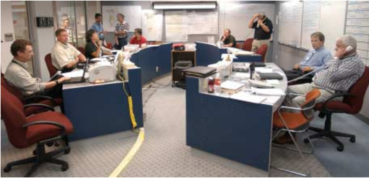
STANDING WATCH — EOC staff and support personnel kept the EOC basement facility staffed 24 hours a day during the first week after the terror attack on the US East Coast.