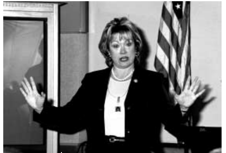
SPEAKING TO EMPLOYEES during an August visit to Sandia/California, well before the terrorist attacks on New York and Washington, Rep. Ellen Tauscher discusses the work ahead for Congress.

Nonetheless, she said her 10-year-old daughter