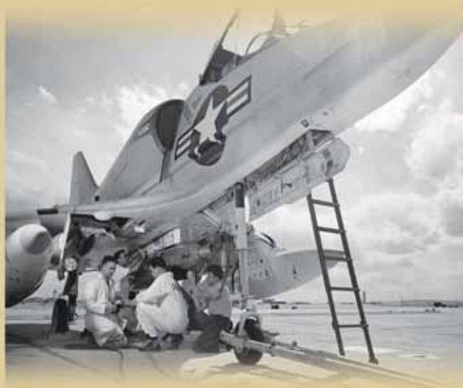
A Sandia-developed instrument pod was loaded on an A-4C aircraft for low-level testing in 1967. Although flight tests were moved from Tonopah to rugged terrain in the Ozarks in 1966 and to other locations in 1967 and 1968, Sandians continued to maintain and operate the instrumentation. Original task force plans called for continued testing into the 1970s, but Vietnam provided a more realistic testing ground.

Events leading up to the 1963 Limited Test Ban Treaty and the establishment of the Readiness Program demonstrate how Sandia's staff and expertise were mobilized to support the nation's nuclear and non-nuclear weapon research and development programs in changing political circumstances. Sandia brought its unique capabilities to many aspects of the program, including test vehicle and weapon design, scientific research, rocketry, modifications to the NC-135 aircraft, and development of instrumentation for low-level testing. Sandia's role in the Readiness Program serves as a straightforward example of how the lab responds to urgent national priorities—an endeavor that continues today.