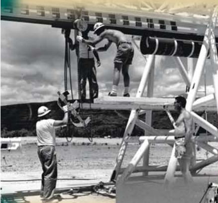
Sandia field testers for Operation Dominic installed a Nike booster on a launcher at Kauai in May 1962.