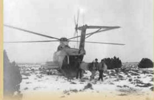
The Tonopah Test Range crew laid out a zigzag course for the aircraft to follow over terrain ranging from flat to mountainous. Using an Army CH 3C helicopter in May 1965, test range maintenance crews delivered orange barrels to mark the flight path for JTF-2 flights.