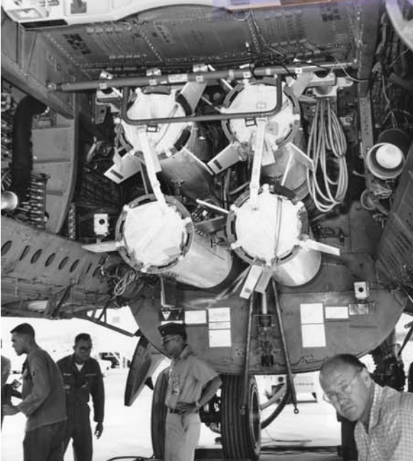
Companion Test Vehicles were used for diagnostic information transmitted to the NC-135s. The number and position of these vehicles varied from test to test.