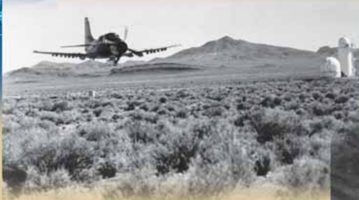
By July 1965, crews of eight different aircraft types from the Air Force, Army, Navy, and Marines had flown 450 low-level sorties. Flight tests proved excellent training for aircraft pilots and crews bound for Vietnam.