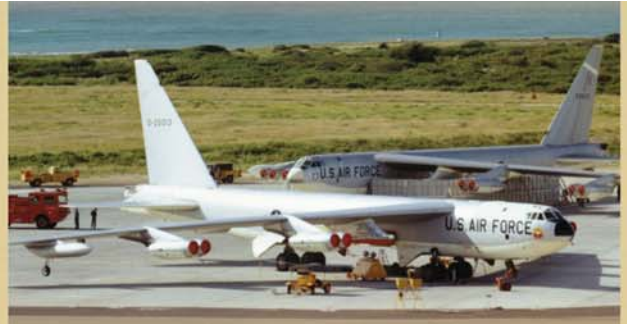
B-52s on the landing pad at Barbers Point Naval Air Station, Oahu, Hawaii, awaited loading of test vehicles for a training exercise. The B-52 assigned Tail Number 0-20013 is now on display in front of the National Atomic Museum.