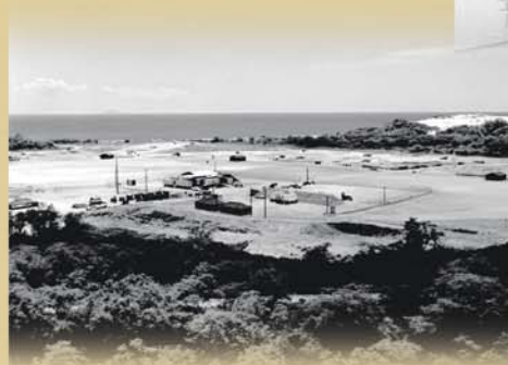
In 1962, the Atomic Energy Commission acquired part of the Auxiliary Landing Field Bonham in Kauai, Hawaii, for launching diagnostic rockets. The site was used for Operation Dominic and renamed the Kauai Test Readiness Facility. Now called the Kauai Test Facility, it remains in use today.