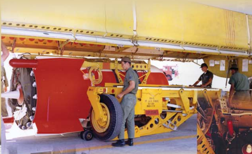
A UTV loaded inside the bomb bay of a B-52 aircraft.

The UTV was lifted into position for loading into the B-52's open bomb bay. Sandia lab personnel were present to witness loading, but only the Air Force did the moving, handling, and loading of the test vehicles. Sandia tested this equipment, minus any nuclear explosive devices, during training exercises at the Kingman Reef site, near Christmas Island, a British Mandate near the Equator.