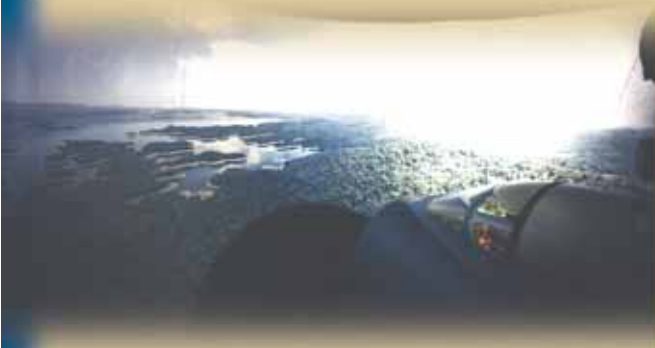
Sandia built a flight simulator by projecting film of test flights on a 160° screen. From the mock cockpit in the center, pilots reacted to situations presented on the screen. Sandia found that success depended less on which delivery system was used than on the training and skill of the delivery crew.