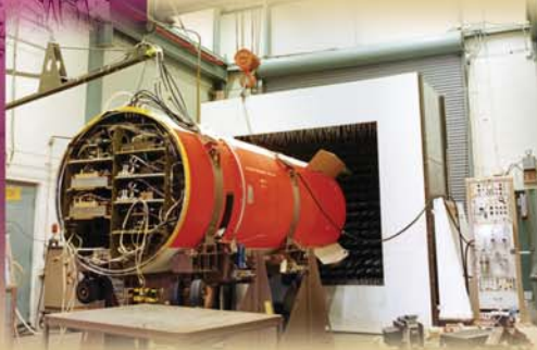
The rear section of a Universal Test Vehicle (UTV) protruded into a free space chamber as part of the pre-B52 loading systems checkout in the assembly building at Barbers Point. Sandia test vehicles (ballistic shapes with arming and fuzing systems) could be tailored to house test devices of various sizes and shapes.