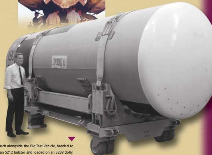
Herb Filusch alongside the Big Test Vehicle, banded to an S212 bolster and loaded on an S289 dolly.