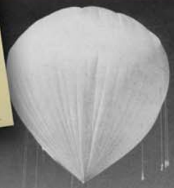
During the Hardtack II test series in Nevada in September and October 1958, Sandia technicians suspended nuclear devices from tethered balloons as a substitute for more expensive towers; balloons became another Sandia specialty.