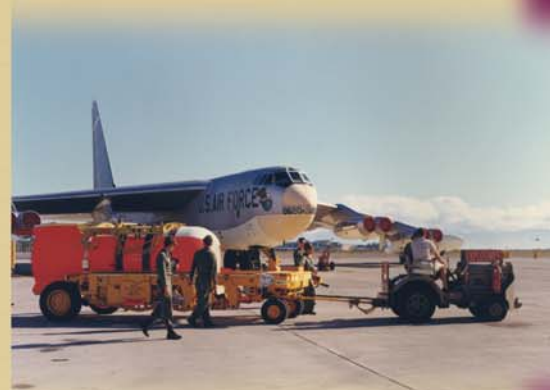
A UTV arrived from the assembly building mounted on its Air Force-designed mobile handling equipment ready to be loaded on a B-52.

The UTV was lifted into position for loading into the B-52's open bomb bay. Sandia lab personnel were present to witness loading, but only the Air Force did the moving, handling, and loading of the test vehicles. Sandia tested this equipment, minus any nuclear explosive devices, during training exercises at the Kingman Reef site, near Christmas Island, a British Mandate near the Equator.