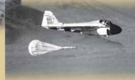
A Navy A-6 aircraft completing a low-level test drop.