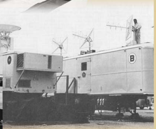
The Dominic operations required extensive laboratory support—the purchasing division worked 60-75 hours a week during the operation, while the packaging and shipping division prepared and shipped 1,333,977 pounds of materiel within six weeks for the overseas operation.