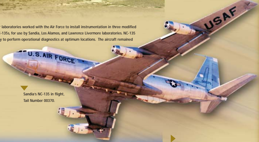
Sandia's NC-135 in flight, Tail Number 00370.

In 1963, Sandia and its partner laboratories worked with the Air Force to install instrumentation in three modified Air Force 707 jets, renamed NC-135s, for use by Sandia, Los Alamos, and Lawrence Livermore laboratories. NC-135 aircraft offered the opportunity to perform operational diagnostics at optimum locations. The aircraft remained in service until 1976.