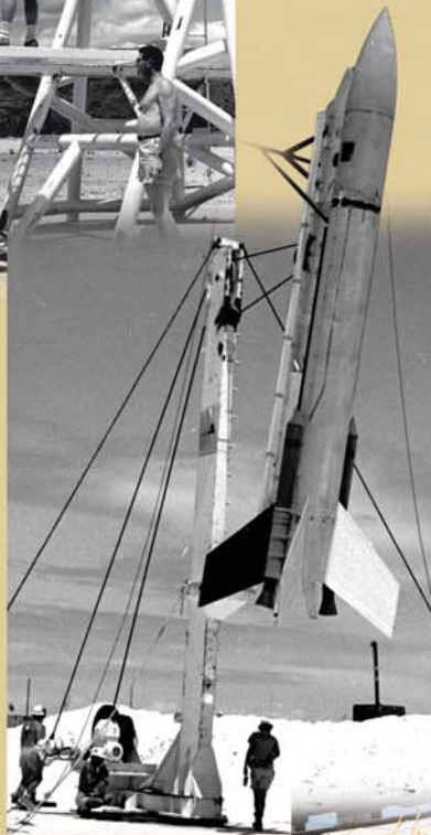
For two months in late summer of 1962, Sandians worked around the clock to design, build, and successfully fire the new rocket—called Strypi. Strypi's name implied that in accepting the challenge Sandia had taken a "tiger by the tail." Although it never carried a nuclear warhead into space again, the Strypi became a workhorse in Sandia's rocket research program.