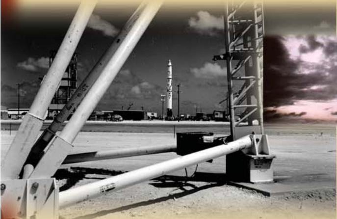
Sandians provided, prepared, and armed the firing system for the nuclear devices carried by the Army's Redstone missiles launched from the Johnston Island area for the Operation Hardtack I Teak and Orange weapon effects tests. On July 31, 1958, Teak, the first high-altitude (252,000 feet) detonation [see inset], produced a spectacular fireball and colorful aurora that was visible from Honolulu 700 nautical miles away. The detonation created a magnetic disturbance in the atmosphere that affected radio transmissions. The less dramatic Orange shot followed on August 11 at an altitude of 141,000 feet.