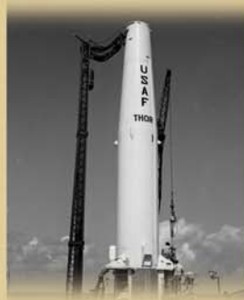
The Thor, designed as an ICBM, had to be reconfigured to carry test payloads. Sandia designed the warhead hardware and modified the payload end of the rocket. After serious malfunctions took the Thor out of action for four months, Starbird asked Sandia to build an alternate carrier vehicle in time for the test series.