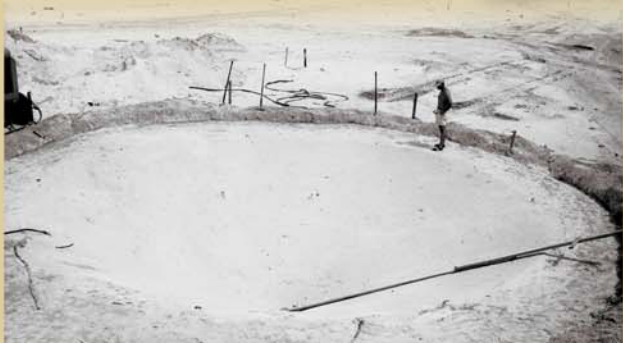
Over the long summer of 1958, Operation Hardtack I detonated thirty-five nuclear tests at Enewetak and Bikini in the Marshall Islands and at Johnston Island. The shots ranged in size from the zero-yield Quince test on August 6 on Enewetak to the 9.3 megaton-yield Popular on Bikini on July 12. Quince left this small crater at ground zero.